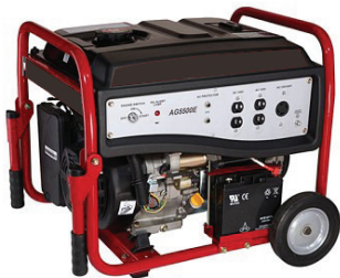
5500 VA Generator (120/240V 46/23A)